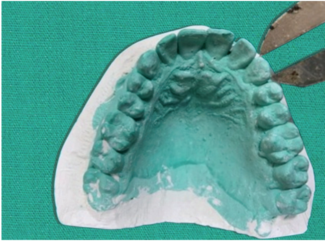
Fig. 1: Left MD canine width measurements using Vernier caliper